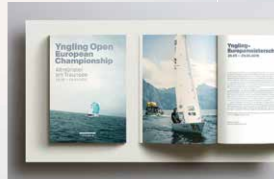
The book.