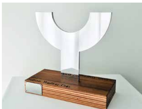
The new perpetual Suisse Yngling Cup Trophy, designed by Peter Kupferschmied. Photo by Peter Kupferschmied