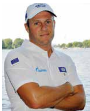
2019 1st German Championship, Star 1st European Championship, Yngling 2nd European Championship, ORC (Taktik) A detailed biography and successes

I think it is a very good regatta solution.