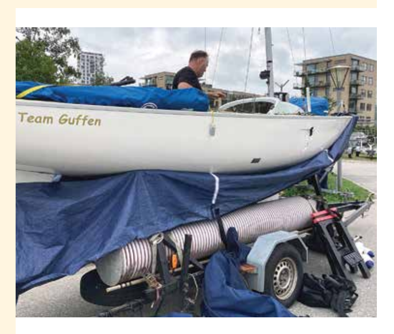
NOR 404 Team Guffen , who crashed in the first race of the last day in Copenhagen, and had to retire with a big hole on starbord side.

Fjærholmen, Tønsberg, August 17-18, 2024