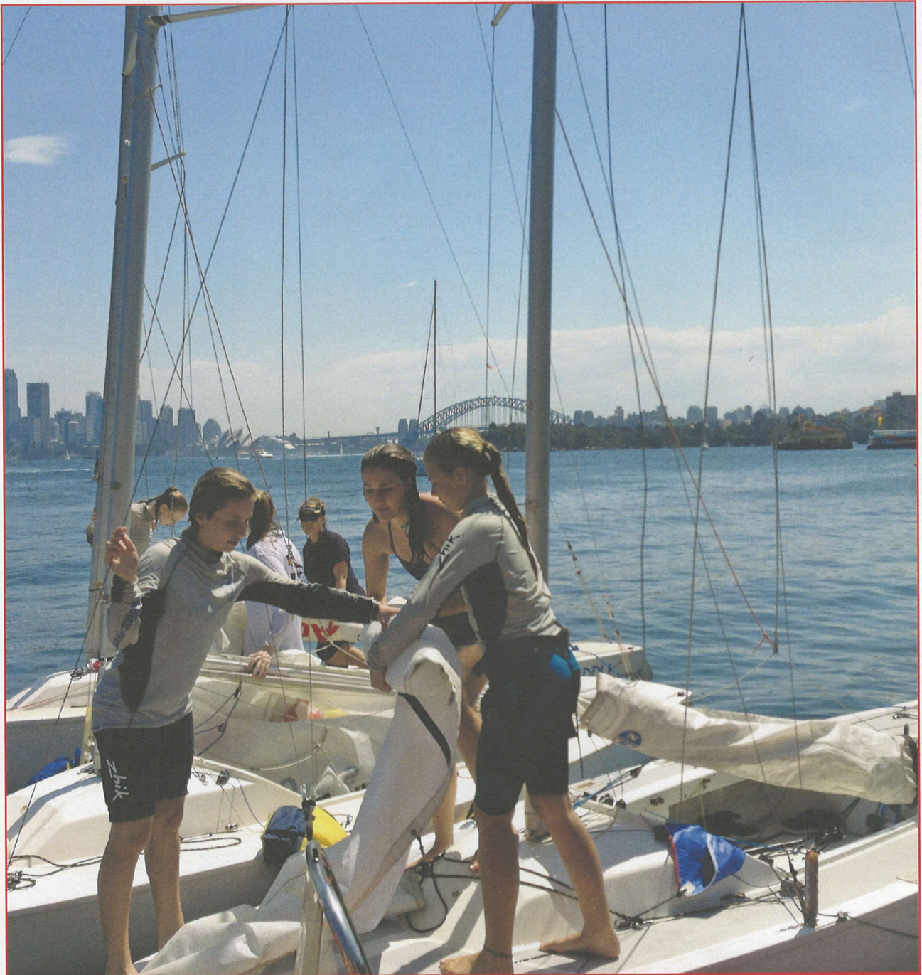
The second day of the RSYS Youth Sailing Keelboat Experienc.