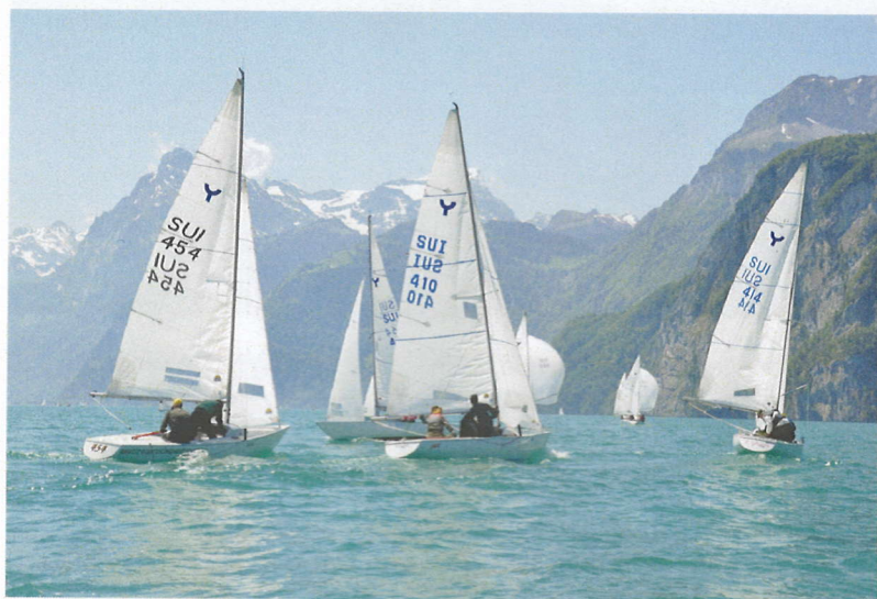
RVB - Regatta in Brunnen