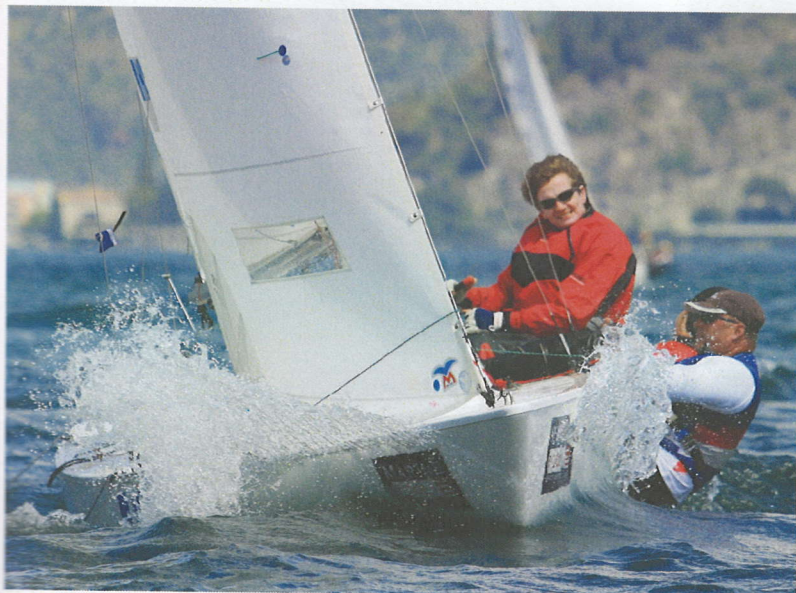
Austrian participants at the Open Springtime Riva Cup 2012