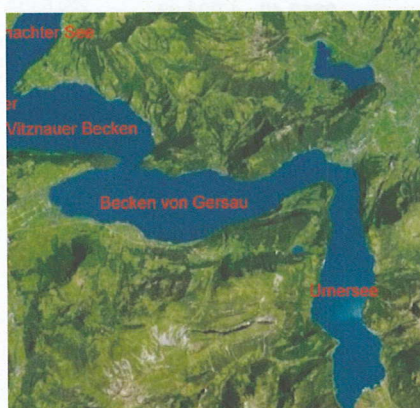
Sailing area Regattaverein Brunnen (RVB)

On the left side the "Urnerbecken" and on the right side the "Gersauerbecken".