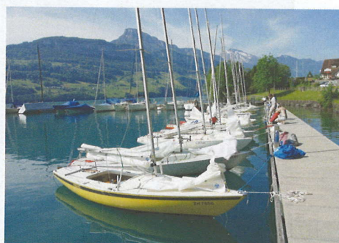
The Harbour "Fallenbach" of RV-Brunnen