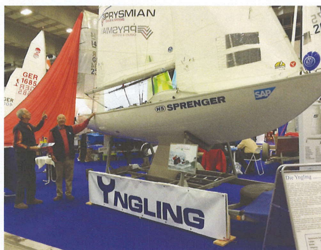
ABOVE: YNGLING AT "BOOT AND FUN" IN BERLIN.