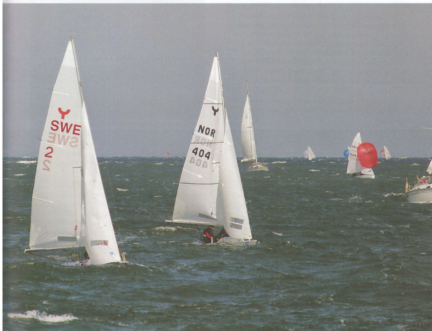
BELOW: SWE 2 AT 2014 WORLD CHAMPIONSHIP, TRAVEMUNDE