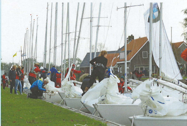
TOP: WINNERS OF THE 2014 DUTCH NATIONALS