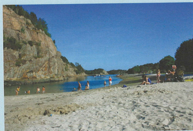
ABOVE TOP & RIGHT: ASKØY YACHT CLUB AND HARBOUR