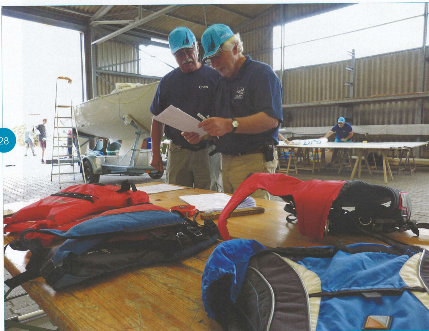
ABOVE: THE FACILITY ALLOWED FOR MOST EQUIPMENT CHECKS TO BE MADE UNDER COVER