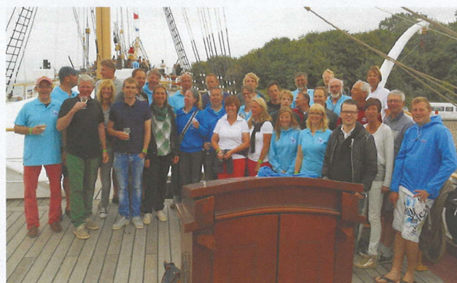
ABOVE: GERMAN TEAMS WHO PARTICIPATED IN THE WORLDS IN TRAVEMÜNDE