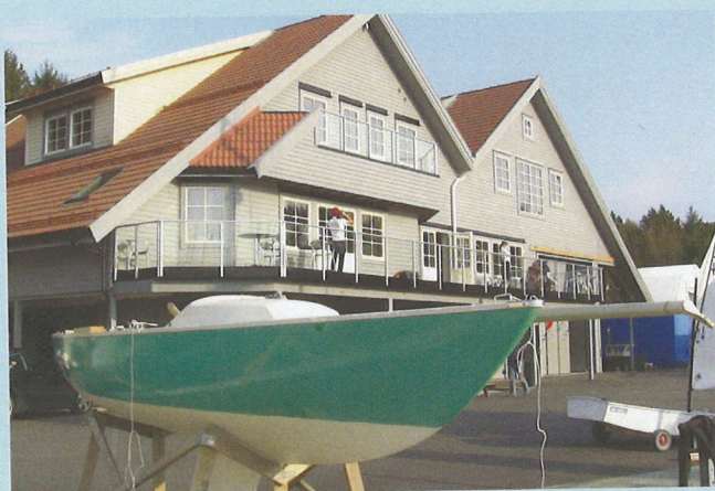
LEFT: THE MAIN CLUBHOUSE